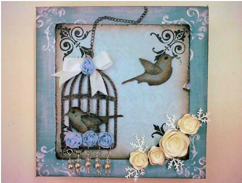
Example of Birdcage Canvas, Saturday January 21st