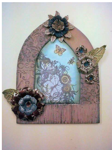
Example of Decorative Arch, Saturday February 18th